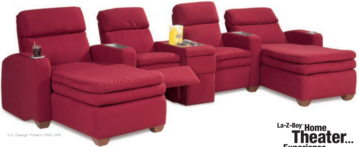
U.S. Design Patent D501,095

Sleek and stylish chairs with luxurious pillow top seats and ergonomic design for optimal viewing and audio create an authentic cinema experience in any room.