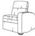
4TM - Left Wedge Recliner 4PM - Left Wedge Power Recliner