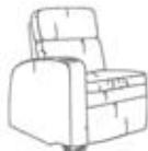
4TR - Right Arm Recliner 4PR - Right Arm Power Recliner