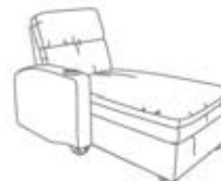
4TV - Right Arm Reclining Chaise