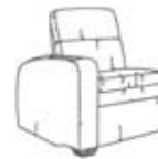
4TN - Right Wedge Recliner 4PN - Right Wedge Power Recliner