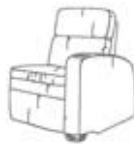
4TL - Left Arm Recliner 4PL - Left Arm Power Recliner