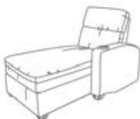
4TQ - Left Arm Reclining Chaise