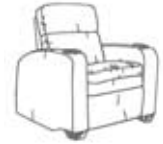
4TP - Two Arm Recliner 4PP - Power Two Arm Recliner